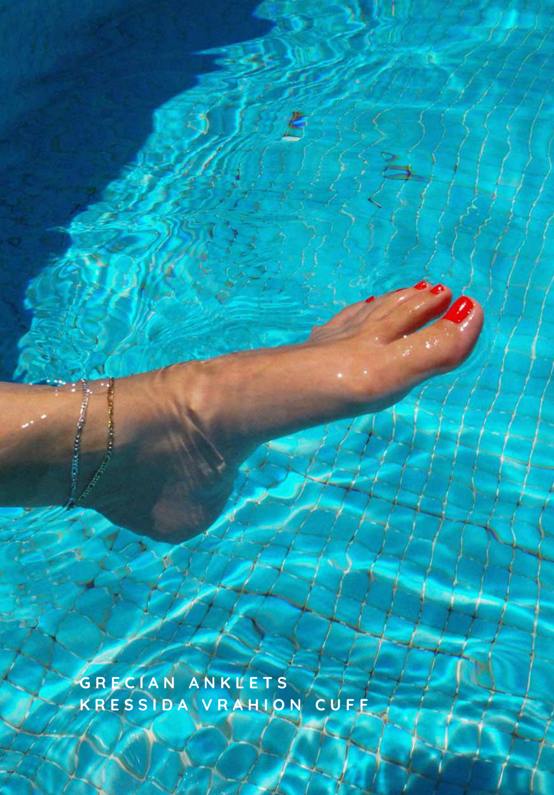
GRECIAN ANKLETS KRESSIDA VRAHION CUFF