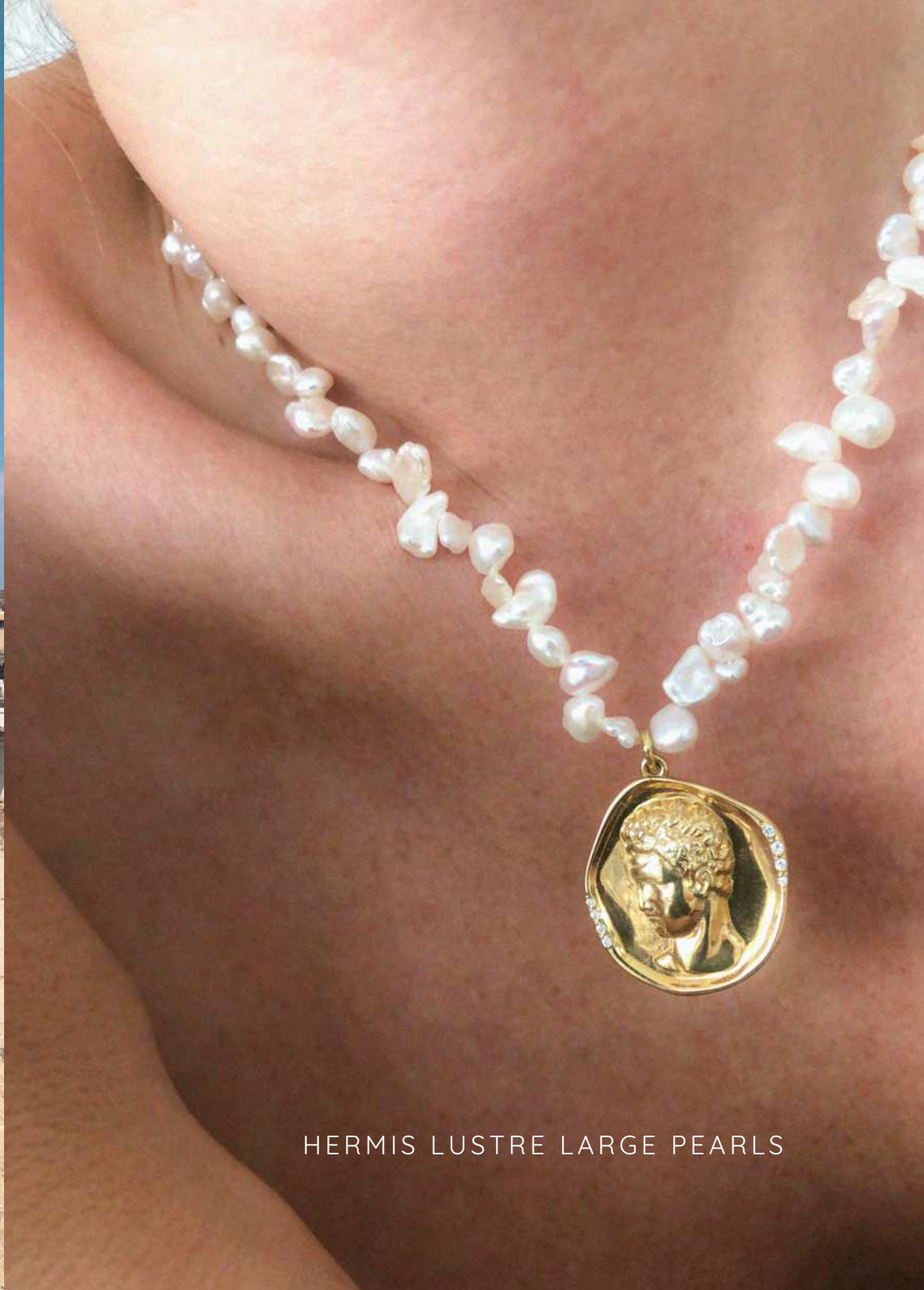
HERMIS LUSTRE LARGE PEARLS