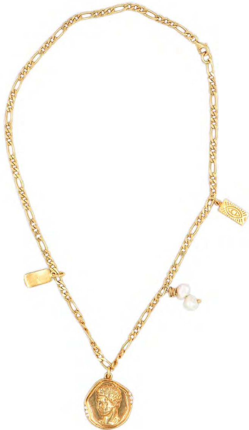
HERMIS LUSTRE SMALL CHOKER