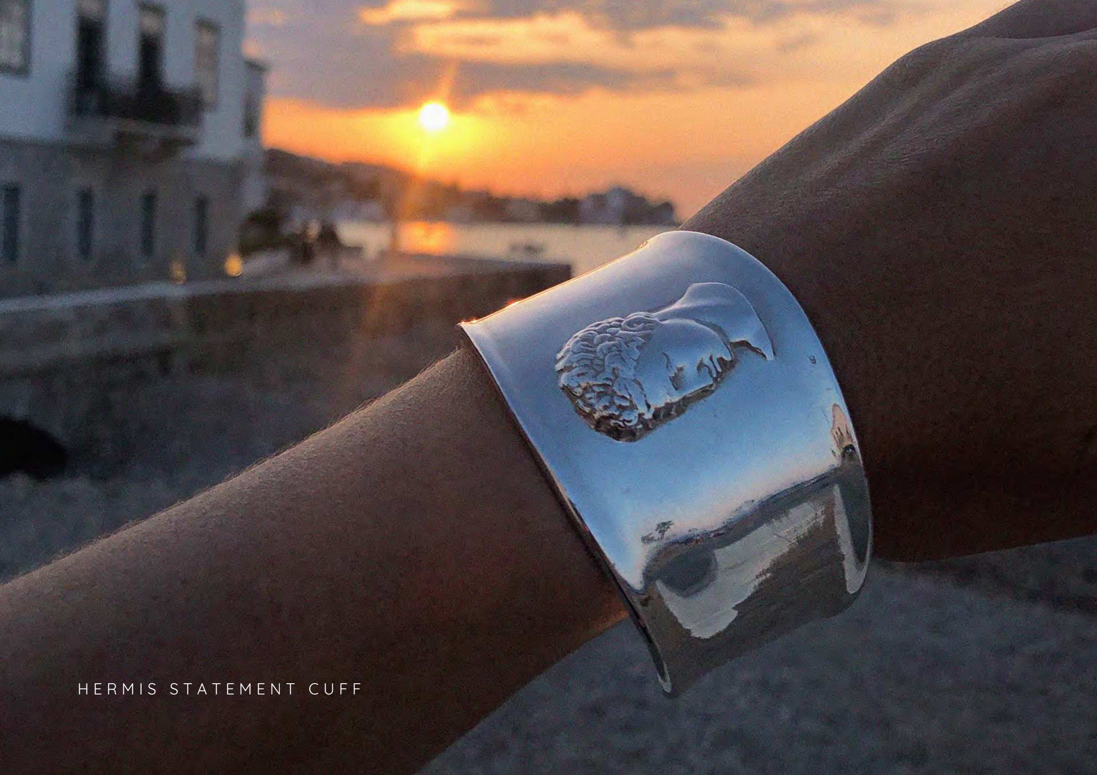
HERMIS STATEMENT CUFF