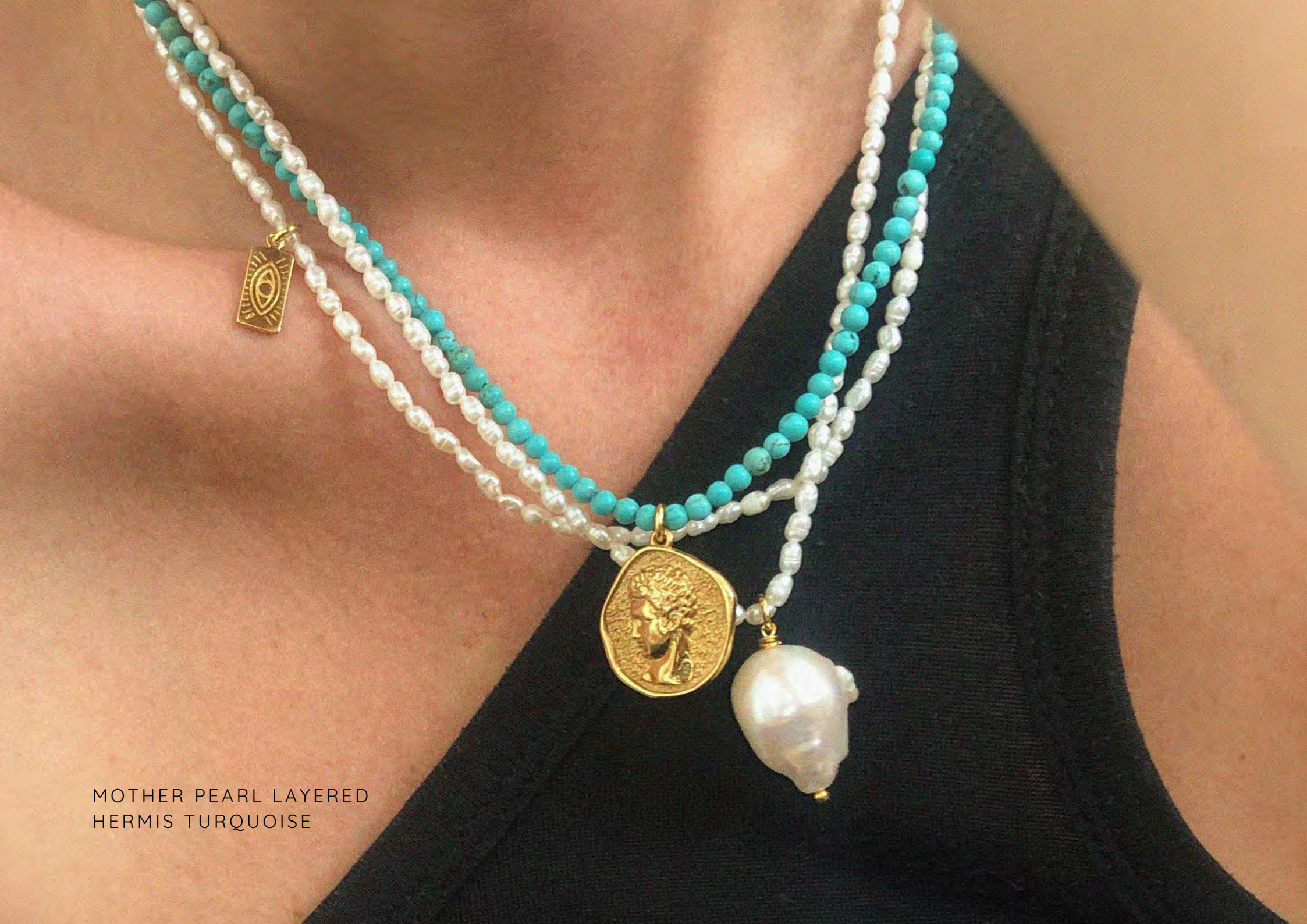
MOTHER PEARL LAYERED HERMIS TURQUOISE