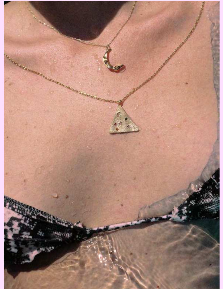
MÉLIÈS LARGE PYRAMIS & MOON