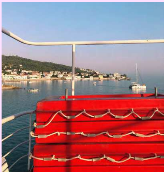
LOST SEA COLLECTION